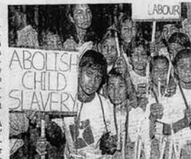
Children participating in a candlelight prayer in New Delhi on Saturday to raise their voice against child labour on International Labour Day.